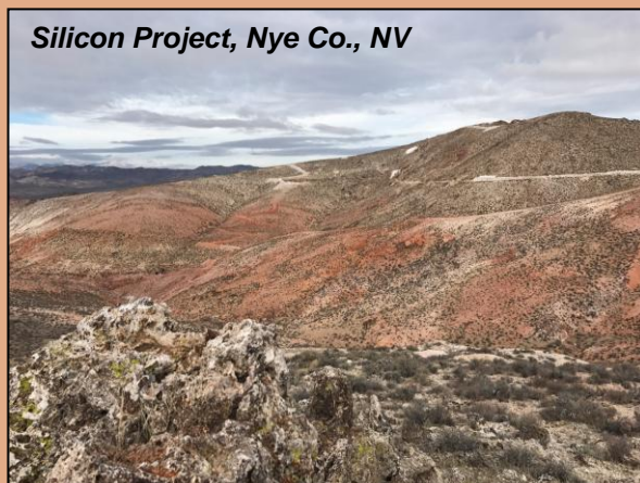
Silicon Project, Nye Co., NV

Renaissance is confident that management's extensive exploration experience and state of the art technical capability that guided AuEx into a major discovery at Long Canyon will continue to direct the Company to new discoveries resulting in strong growth potential for shareholders. The Company believes that its prospect generator/joint venture business model is the most effective strategy for junior explorers by minimizing dilution of shareholders and leveraging risk to partners.